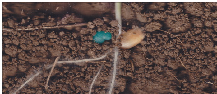
This image of a wheat seedling soon after germination shows no adverse effect on roots from close proximity of a controlled release fertilizer granule.

With the equipment now properly working and calibrated, the response of roots to various environmental stresses will be observed and measured. These measurements may include response of different plant species to variably-placed nutrients and various forms of nutrients. Final products will include both photographs of root development over time and also quantitative understanding of how various nutrient management strategies impact root development. WA-14F ■